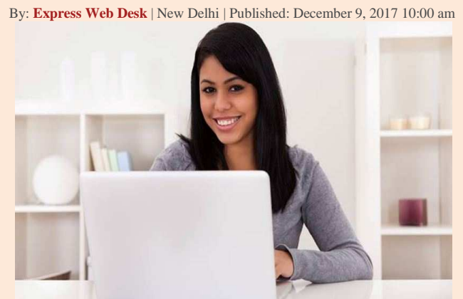
CAT 2017 results are expected to release in the second week of January

Getting admission in the prestigious IIMs (Indian Institute of Management) is strictly through Common Admission Test. Now that the IIM Lucknow has released the answer keys and question paper, the candidate must have calculated their percentile. Even if you think your score may not help you in getting the interview call from the IIMs, here are some other top B-schools that accept CAT score.