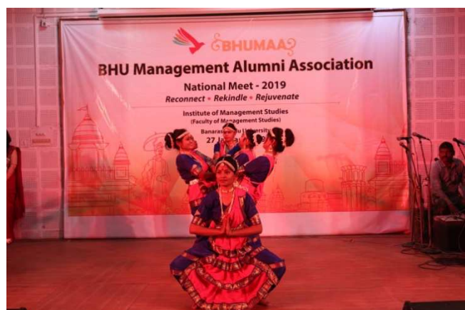
Glimpses of Cultural Program presented by students on the occasion.