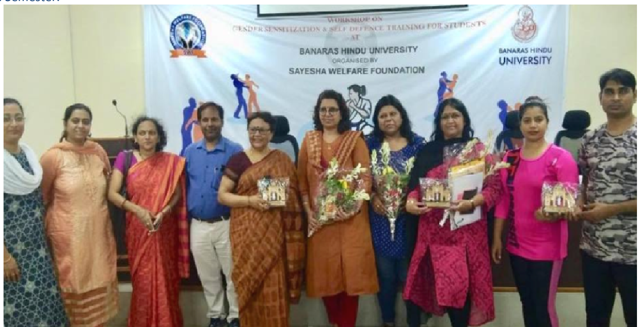
Gender Sensitization & Self Defence Workshop organized on 9 th Aug 2018.