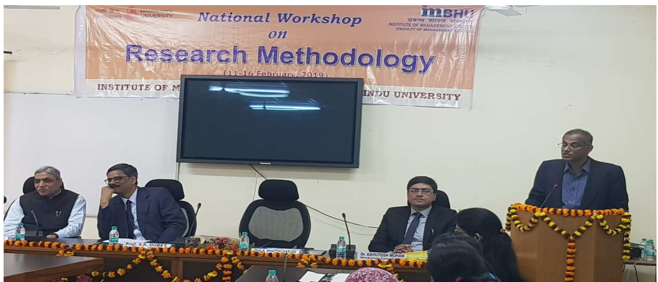
National Workshop on Research Methodology (February 11 th -16 th , 2019)

He further added, "Defining a problem is a most the crucial element of any research. Research is a kind of storyteller and crafting stories requires imagination and observations. There is a need for research that can be linked to the practical problem of the people."