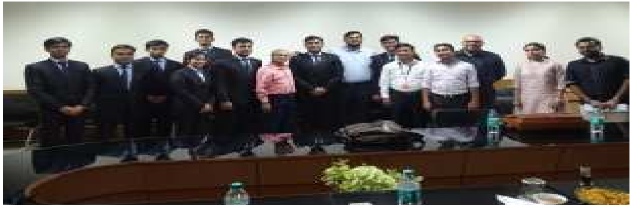
STUDENTS PLACED IN UJJIVAN SMALL FINANCE BANK