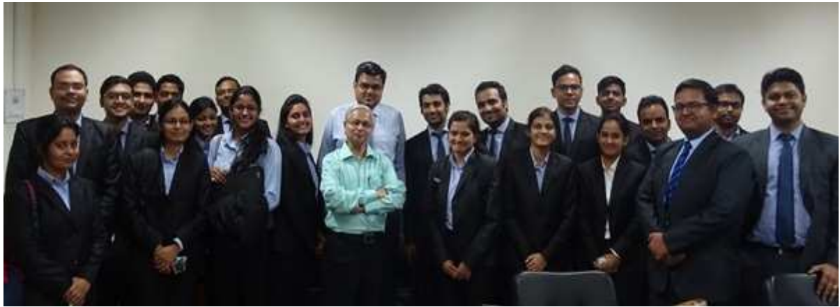
STUDENTS PLACED IN ICICI BANK