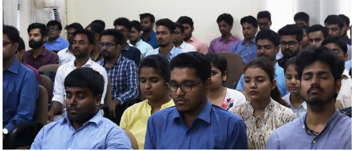
During a practise session