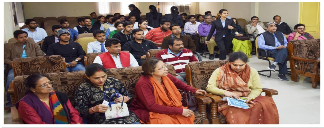
The Lima Sister City Delegation (February 4, 2017)