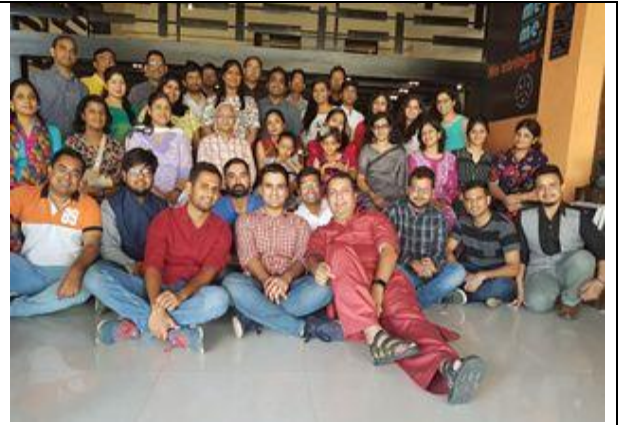
BHUMAA Pune Chapter get together @pune held on 3 rd June 2018