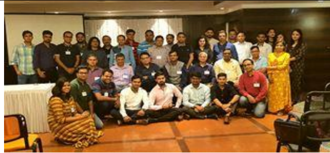
BHUMAA Mumbai Get together on 09 th June 2018