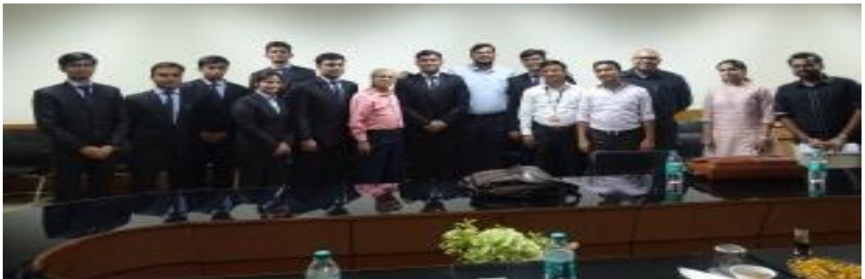
STUDENTS PLACED IN UJJIWAN SMALL FINANCE BANK