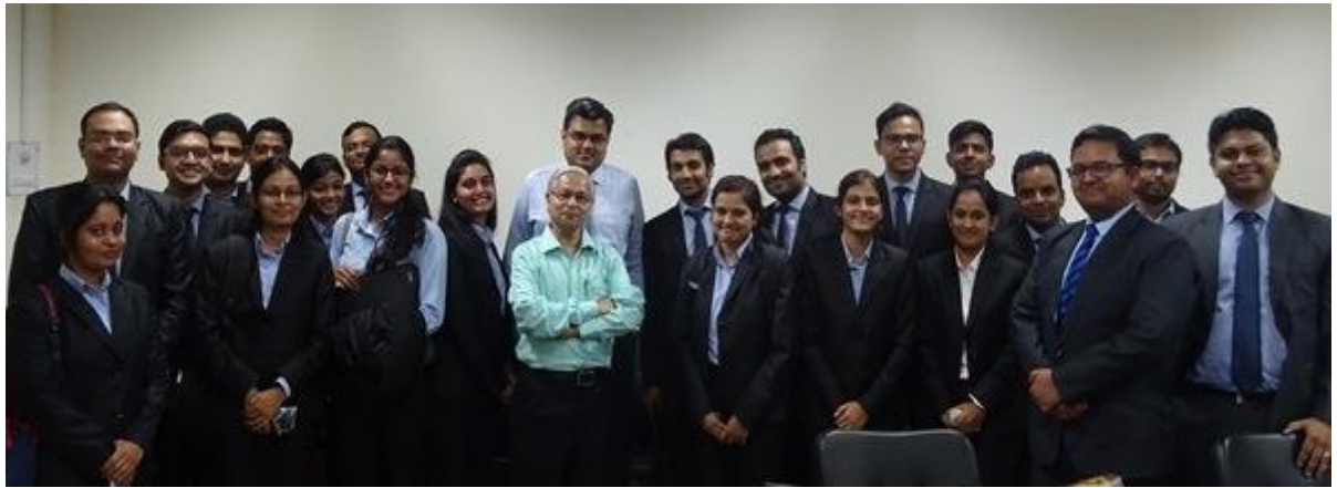
STUDENTS PLACED IN ICICI BANK