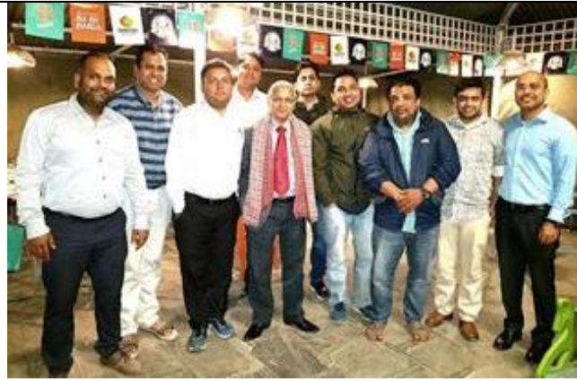
BHUMAA Nepal get together @ Nepal held on 25 th March 2018