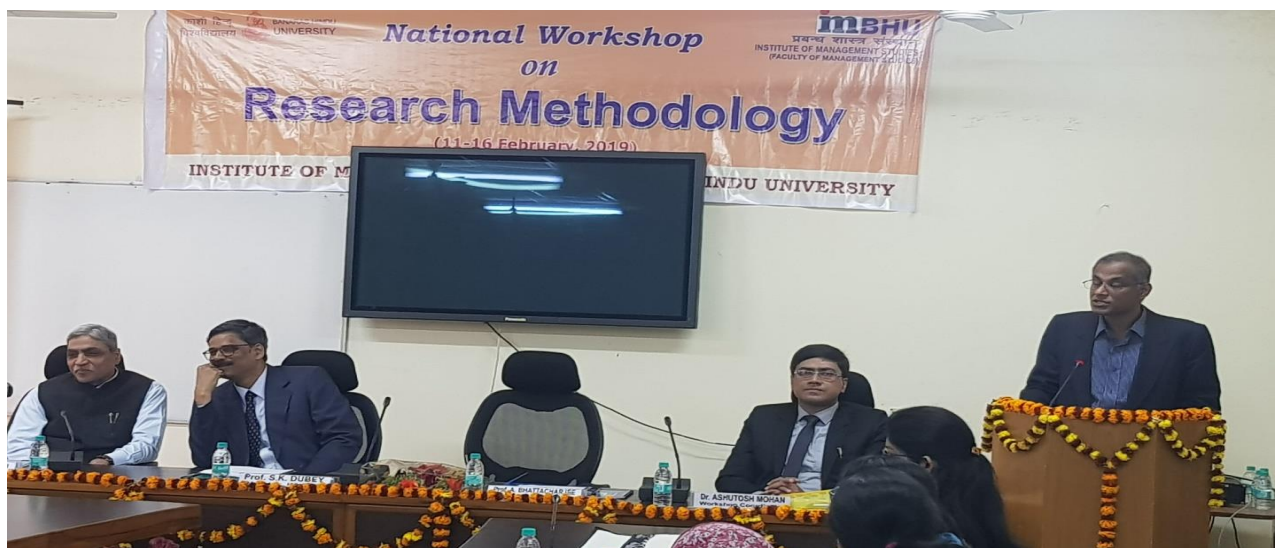
National Workshop on Research Methodology (February 11 - 16 , 2019)

He further added, "Defining a problem is a most the crucial element of any research. Research is a kind of storyteller and crafting stories requires imagination and observations. There is a need for research that can be linked to the practical problem of the people."