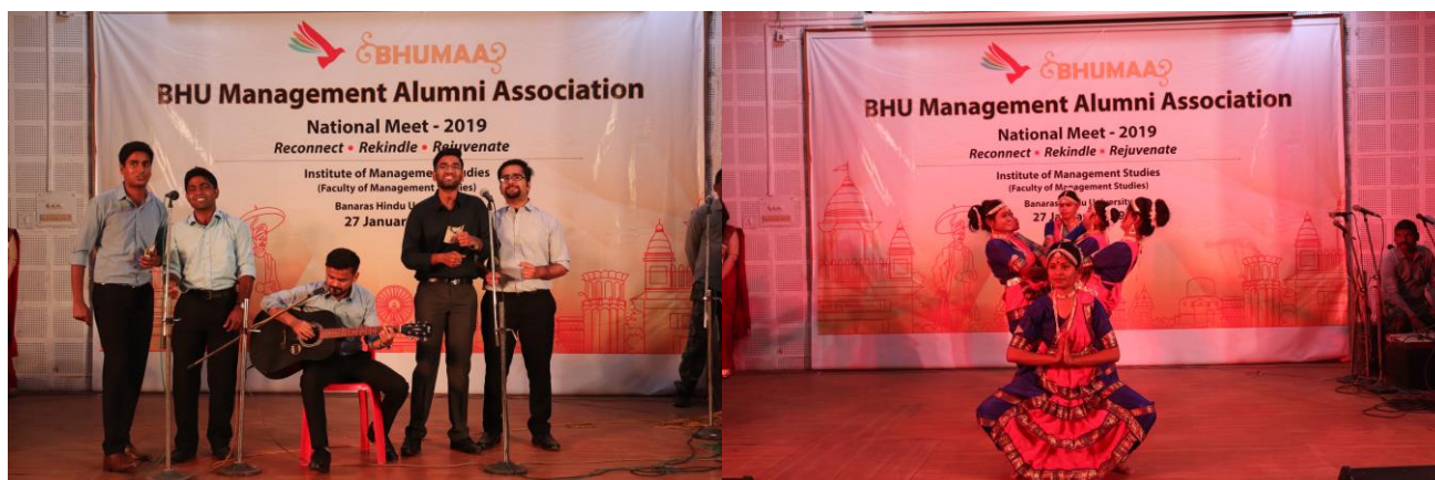
Glimpses of Cultural Program presented by students on the occasion.