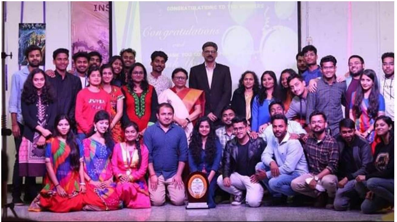
Farewell Get together