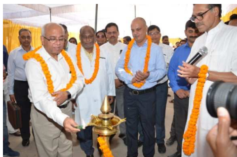
Inauguration of Health Mela - 2018