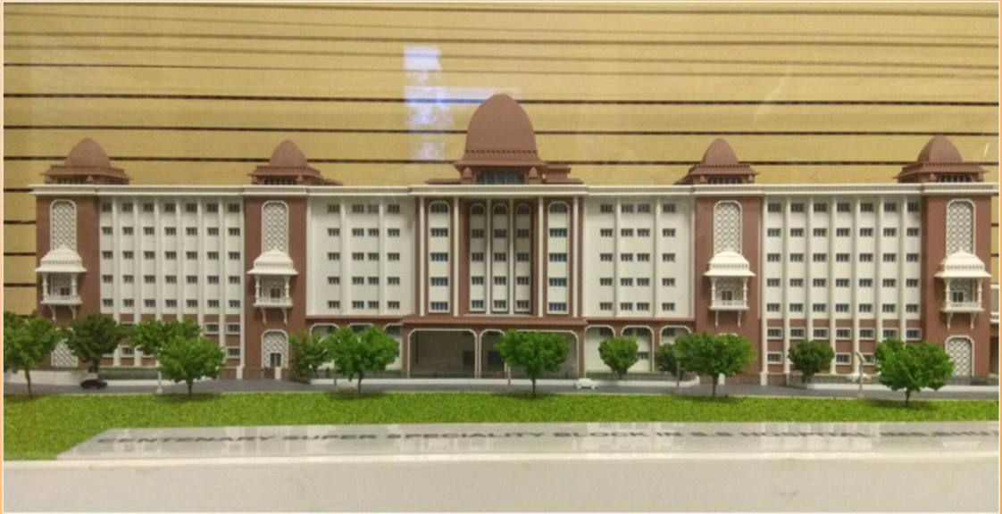
Upcoming Centenary Superspecialty Hospital निर्माणाधीन शताब्दी सुपर स्पेशलिटी चिकित्सालय