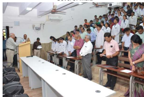
Integrity pledge on the occasion of Vigilance Awareness Week on "My Vision- Corruption Free India"