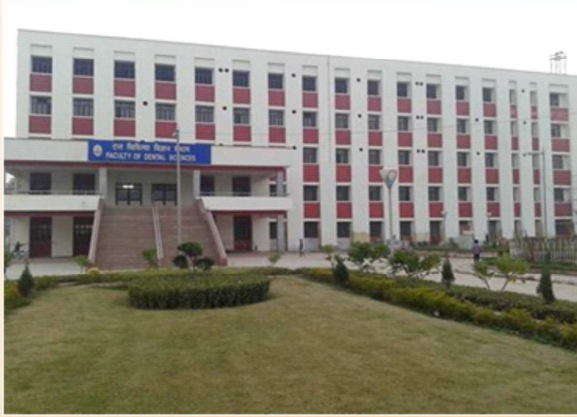
दन्त विज्ञान संकाय Faculty of Dental Sciences