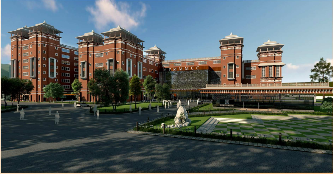
निर्माणाधीन पं० मदन मोहन मालवीय कैंसर सेन्टर Upcoming Mahamana Pt. Madan Mohan Malaviya Cancer Centre