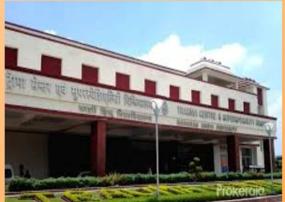
ट्रामा सेन्टर Trauma Centre