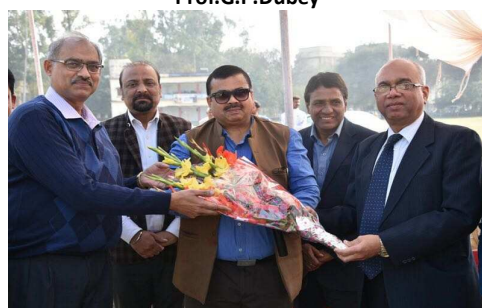
Inauguration of Annual Sports Meet