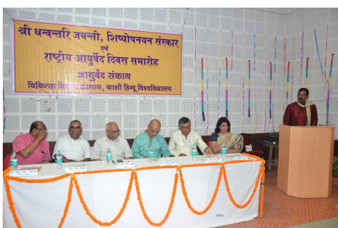
Inauguration of Dhanwantari Jayanthi and Shishyopanayan Sanskar