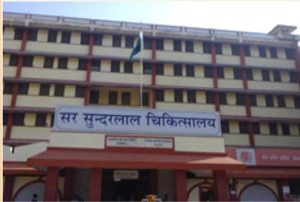
सर सुन्दरलाल अस्पताल Sir Sunderlal Hospital