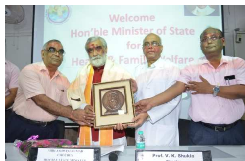
Felicitating to Sri Ashwini Kumar Choubey, Hon'ble Minister of State, Ministry of Health & Family Welfare, Govt. of India