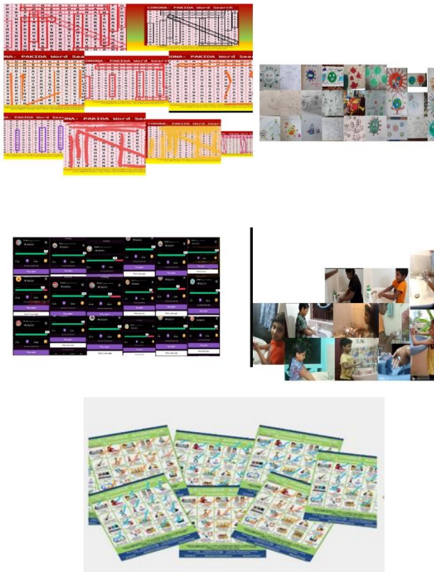
Fig 2. Various games and tasks done by the sample

and tasks were fun and informative. Challenge was the most liked feature of the games (66.7 percent). Word puzzle was responded as the most difficult game and Corona drawing was the easiest one. 90 percent of the sample responded as they were interested to play different awareness games further. Figure 2 shows the images of the games and activities done by the sample.