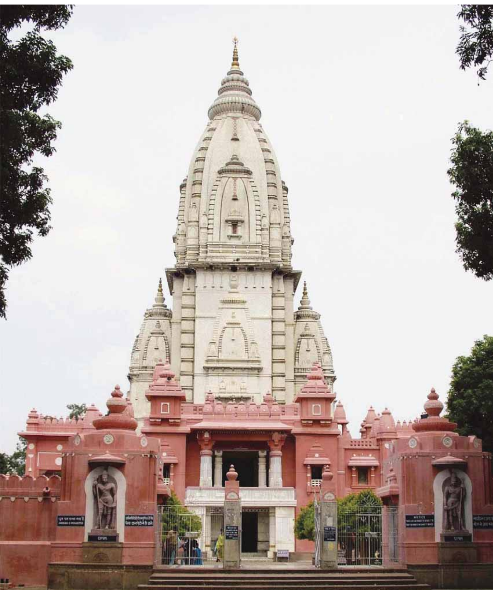
LORD VISHWANATH TEMPLE, BHU