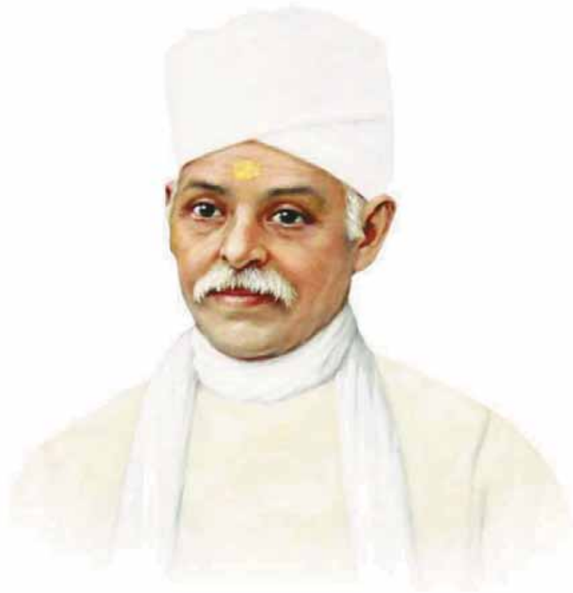
Pt. Madan Mohan Malaviya

It is my earnest hope and prayer that this centre of life and light, which is coming into existence, will produce students who will not only be intellectually equal to the best of their fellow students in other parts of the world, but will also live a noble life, love their country and be loyal to the Supreme ruler.