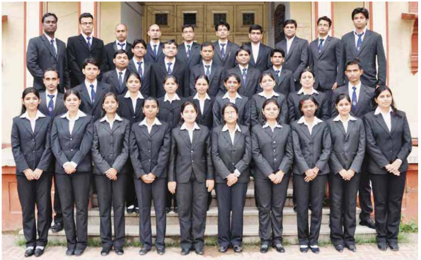
■ DCM SHRIRAM CONSOLIDATED LTD